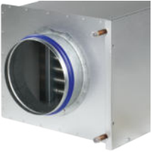
Heat exchanger with copper tubes and aluminium fins